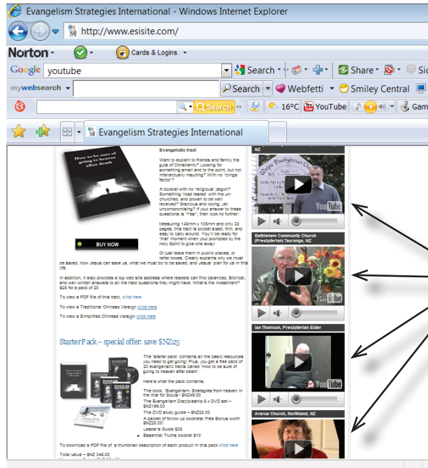
Videos on the web site www.esisite.com

STEP TWO Scroll down the page to view the videos of pastors endorsing the ESI Evangelism Discipleship resources.